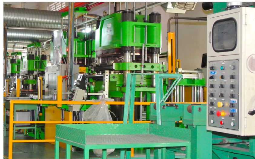
40 COMPRESSED MACHINES