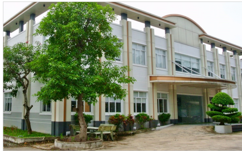
11,500 SQM FACTORY